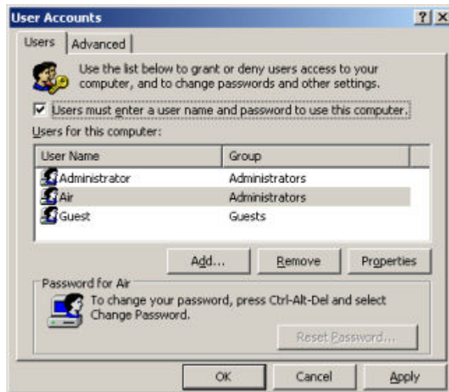
Figure 2: The User Accounts window is shown with the Air username highlighted. The 'Users must enter a username and password to use this computer' option has not been unchecked

4. The next time you restart Windows, you will not be prompted for a username.